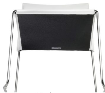
Metal seat pan

BIZZY Dolly to stack a maximum of 15 chairs. Metal painted structure available in different colors. Revolving front wheels, fixed rear wheels.