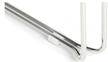
Double flat clip to join more items