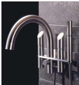
Bathroom faucet from the latest MGS Progetti Collection.